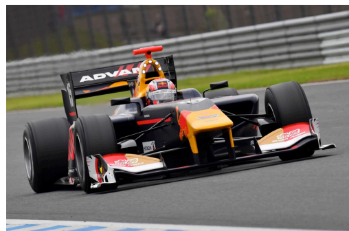
No. 15 Pierre Gasly (TEAM MUGEN) could win the Super Formula 2017 series in his debut year